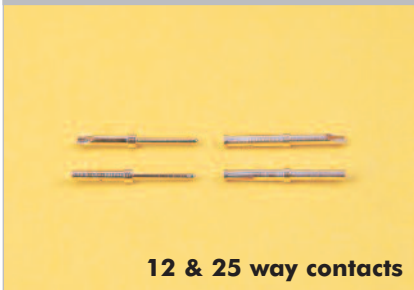
12 & 25 way contacts