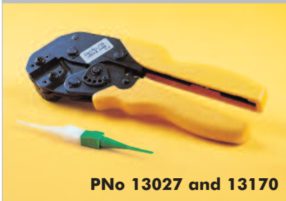
PNo 13027 and 13170